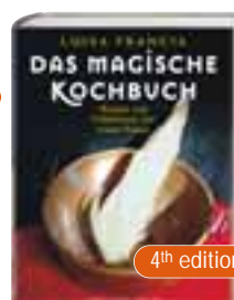
THE MAGIC COOKBOOK ISBN 978-3-485-01097-9