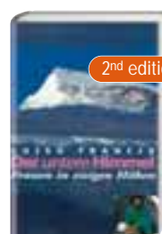
THE LOWER HEAVEN ISBN 978-3-485-00813-6