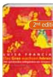
HAVING GOOD HUNCHES ISBN 978-3-485-00958-4