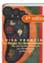
THE MAGIC OF ARRIVING ISBN 978-3-485-00837-2