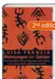
WHERE GHOSTS LIVE ISBN 978-3-485-00900-3