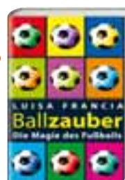
THE MAGIC OF SOCCER ISBN 978-3-485-01074-0