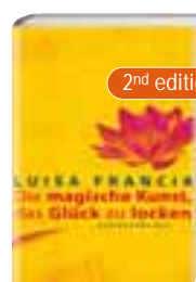
THE MAGIC ART OF CAL- LING ONE'S FORTUNE ISBN 978-3-485-01011-5